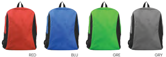
RED BLU GRE GRY

Printing Options : Screen Printing, Heat Transfer.