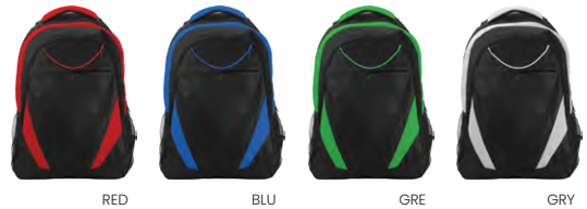
RED BLU GRE GRY

Printing Options : Screen Printing, Heat Transfer.