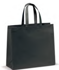
NW-A4-BK for Screen Printing