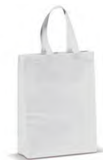
NW-SUB-A5H for Sublimation

Non-woven bag. Product Size : 190 x 240 x 120 mm - A5 Size. Printing Options : White Bag : Sublimation, Black Bag : Screen Printing