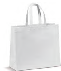
NW-SUB-A4H for Sublimation

Non-woven bag. Product Size : 325 x 250 x 120 mm - A4 Size. Printing Options : White Bag : Sublimation, Black Bag : Screen Printing