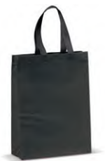
NW-A5-BK for Screen Printing